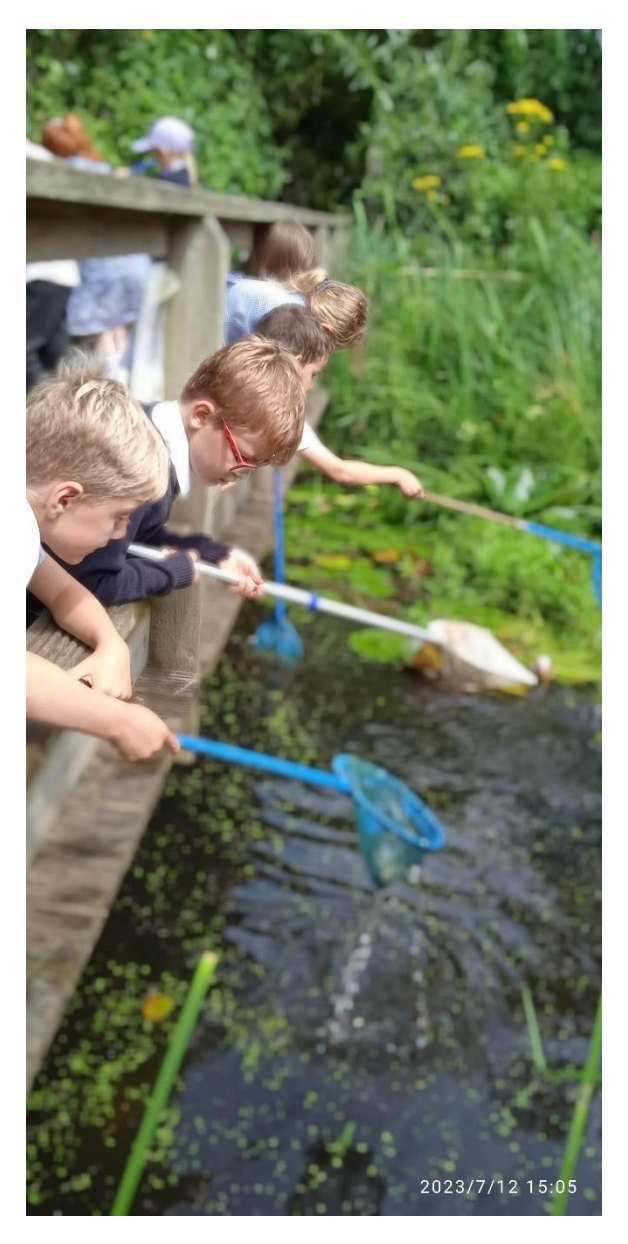
Year 2 children exploring and discovering what lives in our pond.

T: 01736 753135 E: <u>hello@connordowns.org.uk</u> W: <u>www.connordowns.org.uk</u> Connor Downs Academy, Mutton Hill, Hayle, Cornwall TR27 5DH