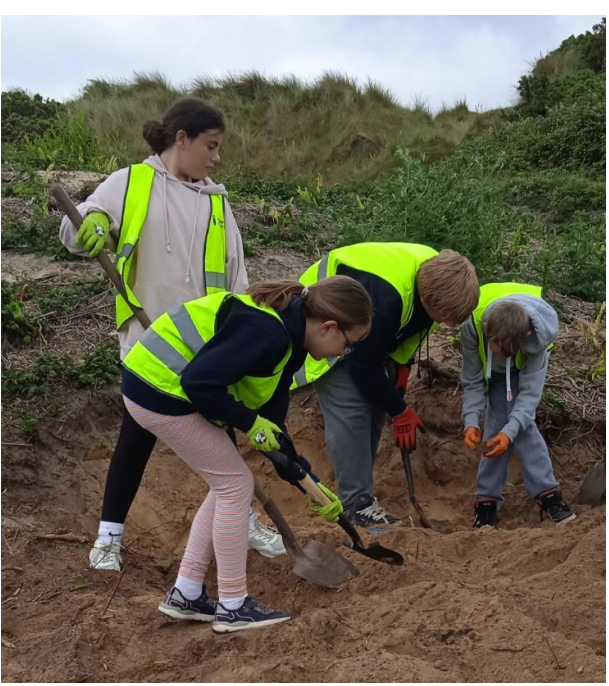
Working as a team to clear the sand.