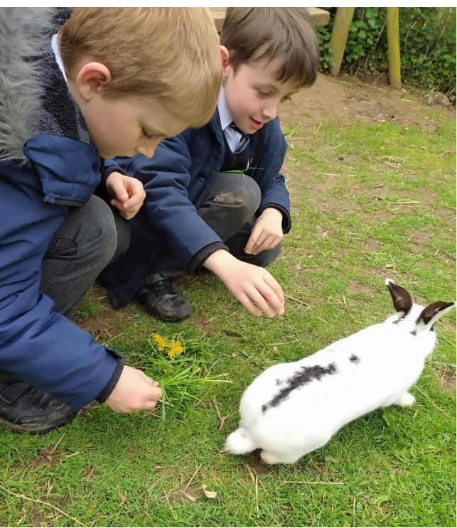
Being directly involved with our animals has definitely benefited the health and wellbeing of the children.