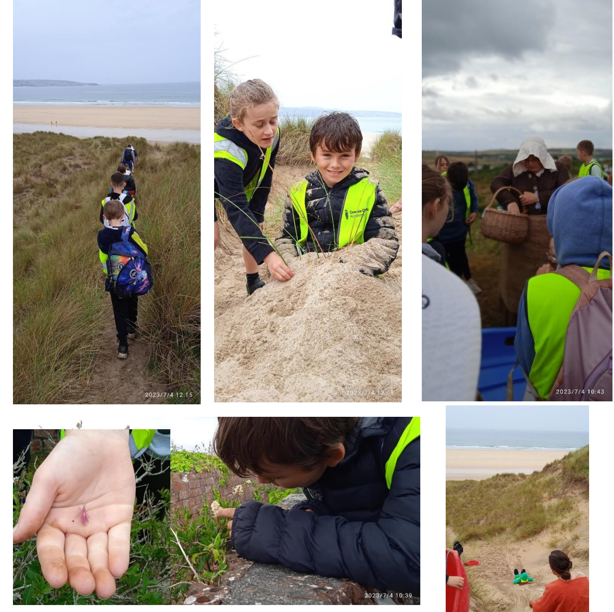
A rare pink cricket was discovered during our towans visit

Year 5 have been exploring our local sand dunes once again and recently discovered the history behind the dynamite towans and the National Explosives Factory that existed here before and during the Great War.