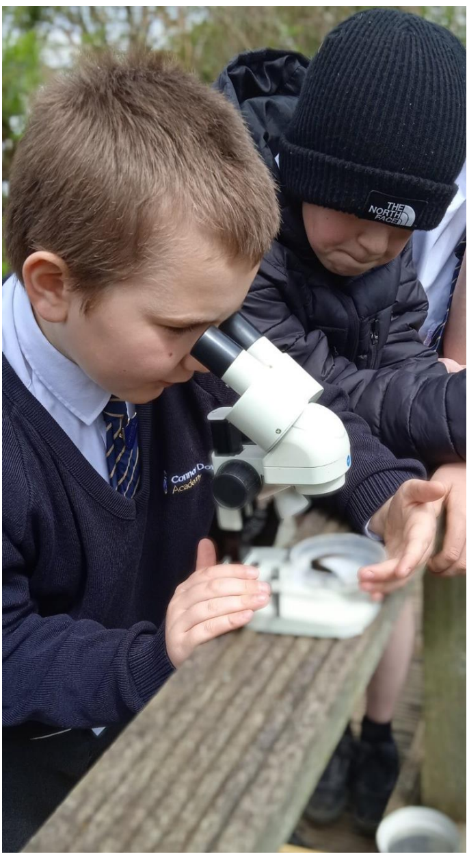
They were amazed when they observed the detail on the newts and dragonfly exoskeleton.