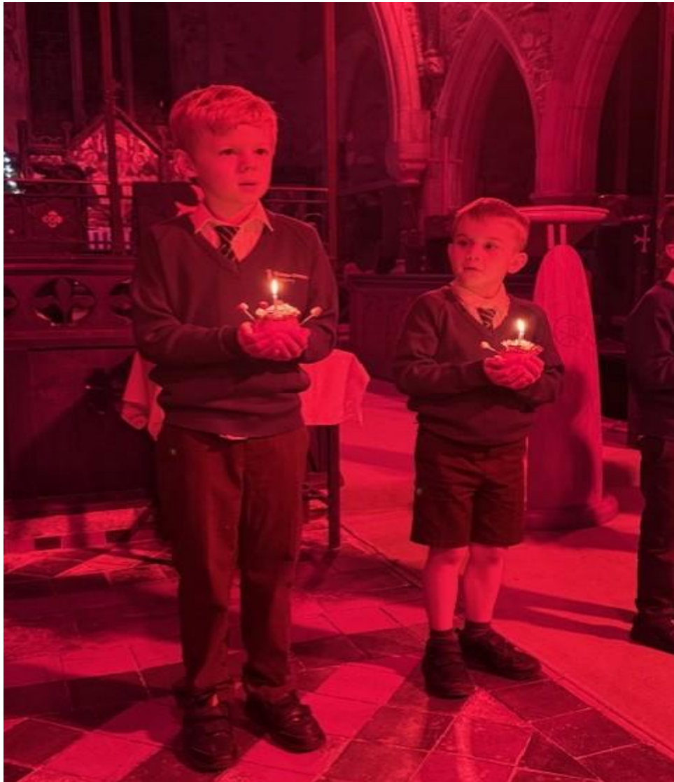
The beautiful Christingle service at Phillack Church.