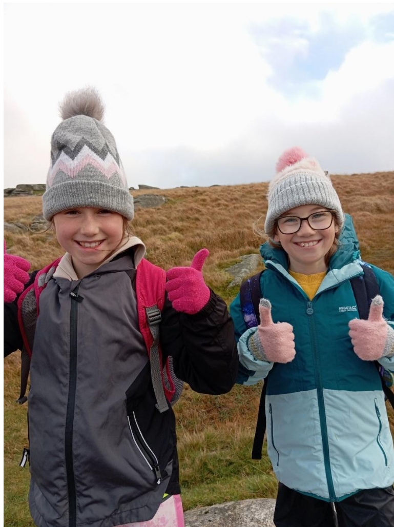
Rough Tor explorers!

These experiences have provided valuable and memorable learning opportunities which have been embraced by the children.