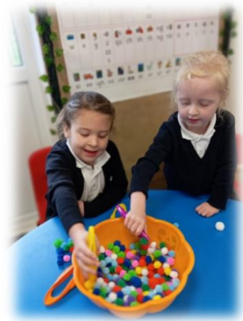
EYFS having fun exploring.