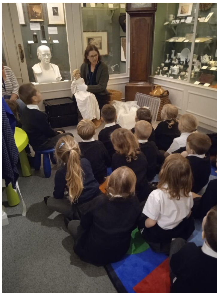
Year 1 visiting Penlee House and Museum as part of their history topic looking at toys past and present.