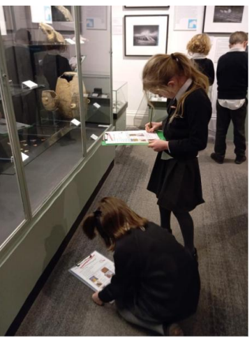
'Thank you for your recent visit – we all really enjoyed working with your class and had a brilliant day. They were such an awesome class; both the volunteers had a wonderful day. The children were super inquisitive and thoughtful in their discussions.'