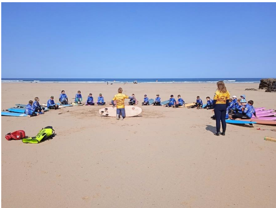
Surfing at Gwithian Beach with Global Border- May 2023

The summer term, along with the entire school year, has been packed with exciting learning taking place in the classrooms, outside in Cultivating Futures and within our local environment and beyond. The children have experienced a rich and varied range of enrichment activities to support their curricular learning including school visits, special visitors and opportunities for residential experiences along with a huge array of sporting and arts events.