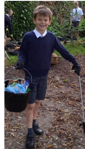
A litter pick is carried out each week