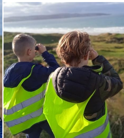
Looking out to sea