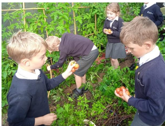
Harvesting tomatoes and cucumbers.

They have also been getting close to our chickens, comparing their features to other animals while learning how to care for them.