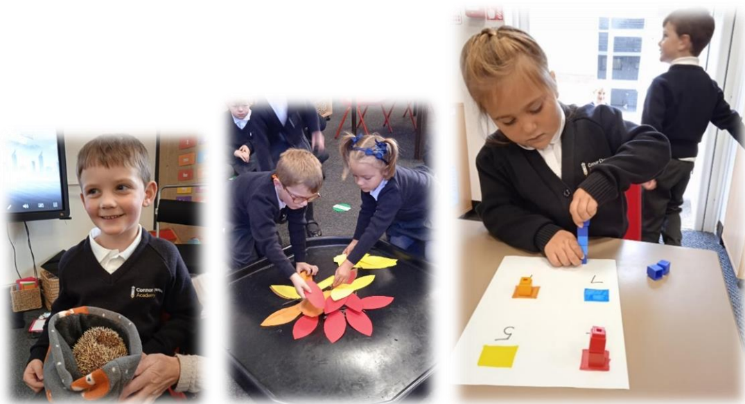
EYFS having fun exploring.

Back in September, we welcomed our youngest children into Reception and we are delighted with the way they settled so quickly, made friends and embraced their learning.