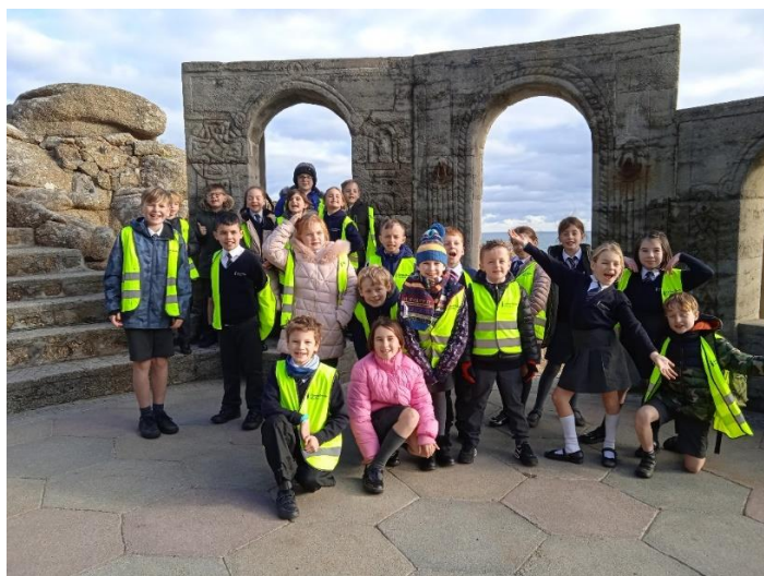
Year 4 performing 'Twelfth Night' at the Minack Theatre

Year 5 on their expedition to the summit of Rough Tor, launching their biography work on Sir Ernest Shackleton.