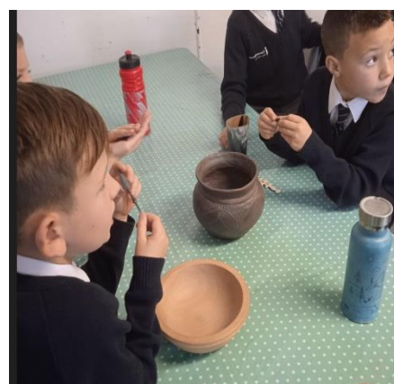
Year 3 being history detectives in Penlee Museum, Penzance.