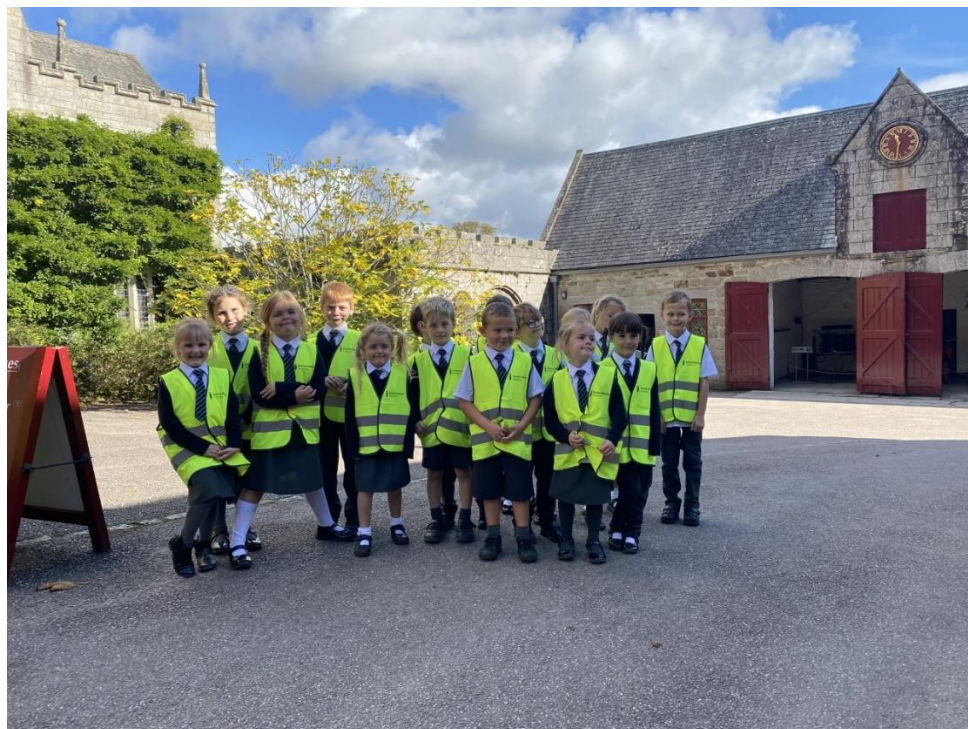
Year 2 visiting Lanhydrock House to support their story writing.