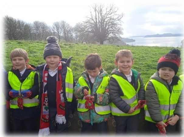
EYFS visiting Trellissick Gardens.

These experiences have provided valuable and memorable learning opportunities which have been embraced by the children.